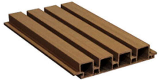
Wallpanel outdoor (180x35)

Other colours & profiles available upon request